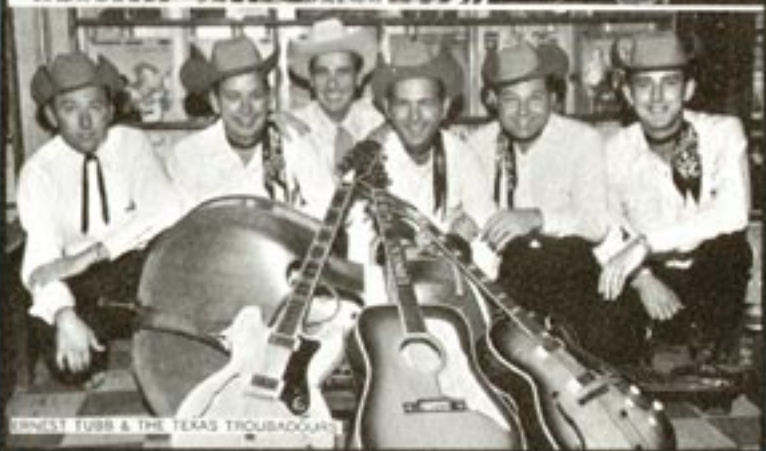
ERNEST TUBB & THE TEXAS TROUBADOURS