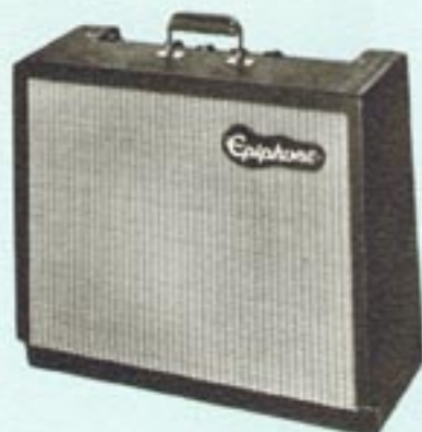
Emperor Deluxe Zephyr