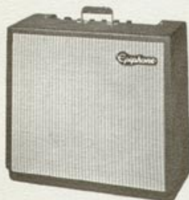
Century Challenger Devon